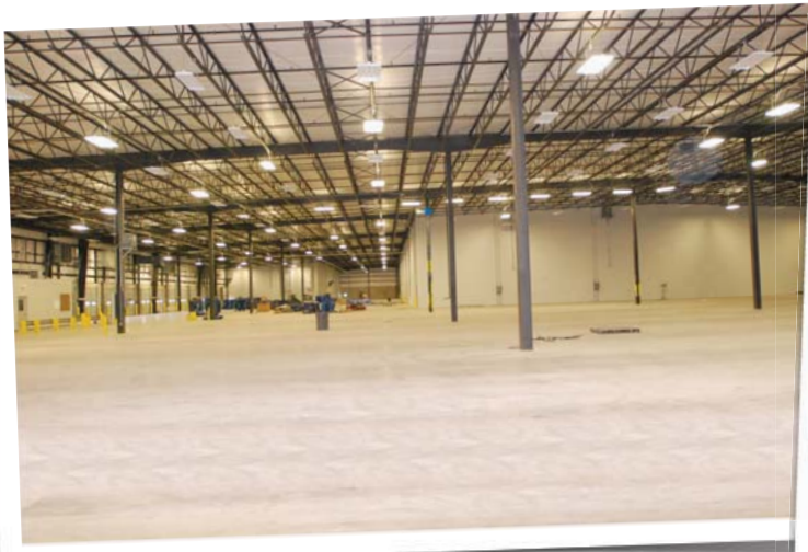
- existing conditions