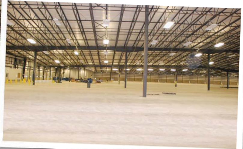
- visualization with center room removed